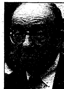
ALAN GREENSPAN , Federal Reserve Chairman, seems to support SEC oversight.

WASHINGTON—When it comes to securities regulation, Federal Reserve Board chairman Alan Greenspan said Fannie Mae and