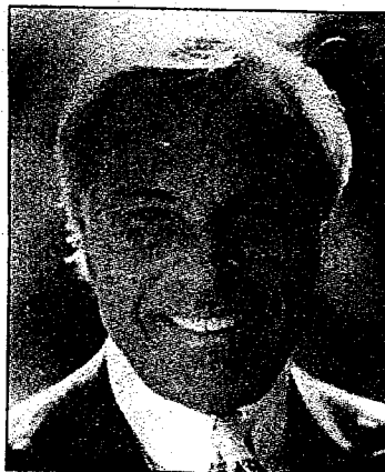
ANGELO MOZILO , Chairman of Countrywide, says downpayments contribute to a homeownership gap.

better society," he said at the America's Community Bankers' National Real Estate Lending Conference here last week. "is to make sure those who don't have a house have the opportunity to get one."